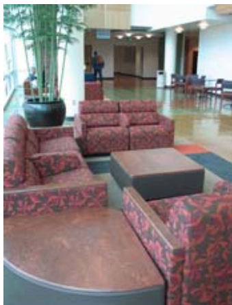
Above: South entry of the Student Union addition, designed by Lombard-Conrad Architects

The new Student Union addition features a sunny galleria where Linn® Series seating forms small lounge areas, perfect for staff and students' informal meetings or reading. Offices, the bookstore, an upscale dining center, ballrooms, billiards, bowling and special activities make this a busy center for students and visitors. Linn® Series chairs, sofas and tables fit a variety of smaller lounge and waiting areas.