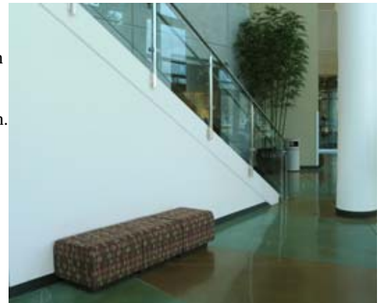
Right: Benches in a coordinating fabric fit in more casual seating—flexible and economical.