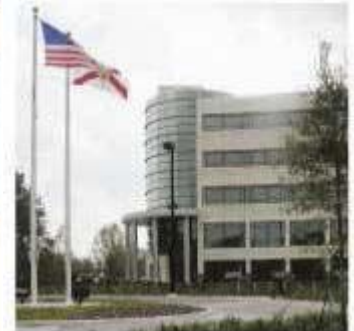
Partnership II Building is one of several UFC research park facilities for firms like Institute for simulation & Training, housing research and administrative staff.