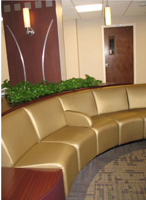
Hallway Y shape divider visitor seating

Hartford Hospital is the region's leading medical center, recognized for services from specialized physician's care to their Level 1 Trauma Center.