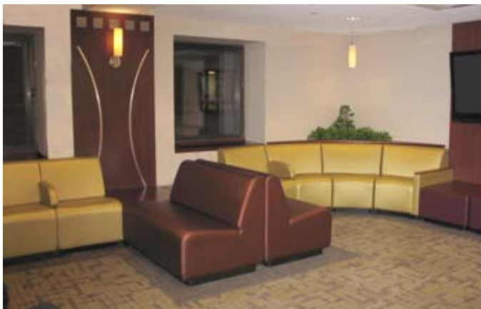
TV corner visitor seating areas

Taking advantage of the extensive sizes available in the Laurel Series , the architect has been able to provide seating for 48 people within limited space. Chair segments with true radius curved seat fronts and chair backs soften the environment, while providing many individual areas for people to wait.