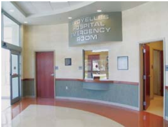
Above: New ER area