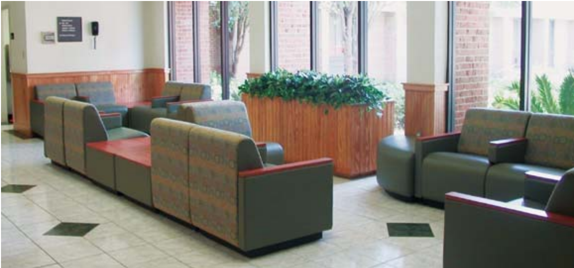
Front lobby, original building