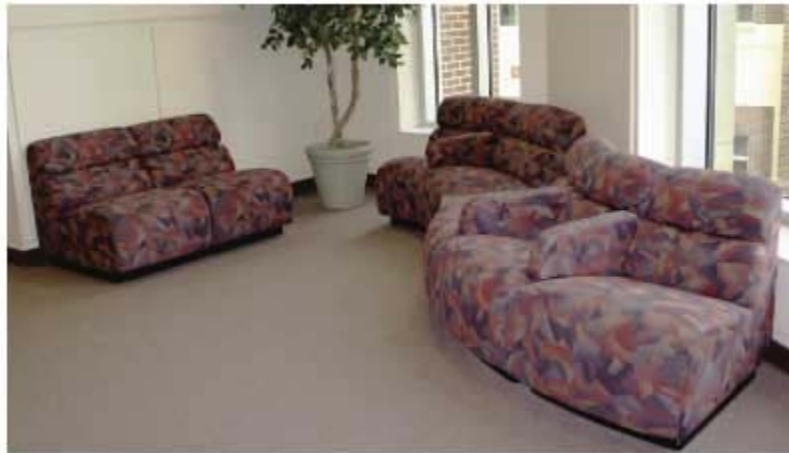
Models shown include rectangular chairs 3001, 3051-12 inward and 3061-12 outward chair segments and various laminate tables, which can be rearranged to new combinations if desired.

Linn® Series chair segments work with angular and curved walls around the atrium on upper floors. They create pleasant small waiting and study lounge areas, servicing the building's academic offices, labs and classrooms.