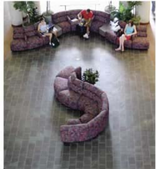
Linn® Series seating shown was installed in 1999; still looking very good when these photographs were taken in 2005.

Linn® Series chair segments work with angular and curved walls around the atrium on upper floors. They create pleasant small waiting and study lounge areas, servicing the building's academic offices, labs and classrooms.