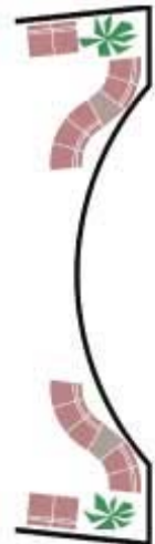
Models shown include rectangular chairs 3001, 3051-12 inward and 3061-12 outward chair segments and various laminate tables, which can be rearranged to new combinations if desired.