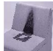
As shown in the photo, the foam August uses for CA133 does not support combustion.

CA 133 requires that an upholstered seating unit pass a full scale burn test. Over 50 full scale burn tests of August seating have been completed by U.S. Testing. All passed CA133 by a high margin of safety. The table at left from U.S. Testing shows the actual test results of the upholstered seating used by Middlesex College.